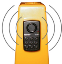
Motion Activated Anti-Theft Alarm