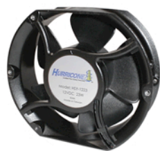
50,000 hour long life brushless DC motor