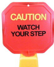
Octagon Warning Sign