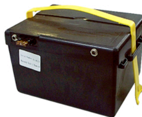
12 Volt Sealed Lead Acid [SLA] High Rate Series