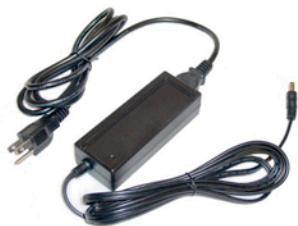
Smart Charger Circuitry: Eliminates the need to unplug the unit after charging