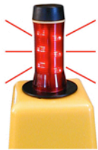
Flashing LED Light