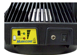
LED & Audible Warnings of Low Battery Voltage